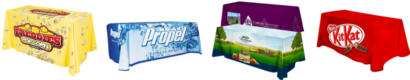
Table size: 182.88cmL x 76.20cmW x 73.66cmH (72"L x 30"W x 29"H)<br/>Table cover size: 330.20cmH x 223.52cmW (130"H x 88"H)

Create a custom tradeshow display with our promotional 4-Sided table throws. Made from quality polyester fabric, which is machine washable, and can be reused over and over again.Using our 4-sided table clothes will make your customers see your brand from all four sides. Our dye sublimation table covers provide a professional appearance for your display, attract the attention of your potential customers. It's ideal for promo events and tradeshows to add an extra visual element to your display.?